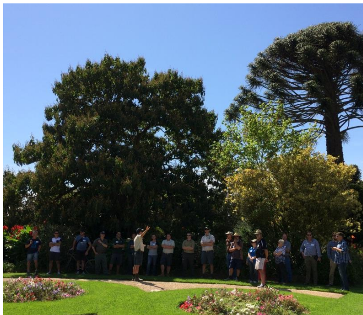
Above: A BGANZ forum at Werribee Park in March 2016.

BGANZ holds regular forums and conferences to share information and promote the interests of botanic gardens and arboreta, from large capital cities to small regional towns.