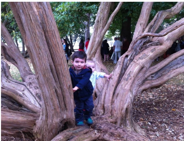
Above: Children enjoy the Akiraho tree ( Olearia paniculata ), one of the special New Zealand plants in our garden.