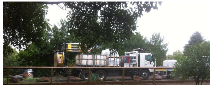
Above: The take-over of the front entrance and drive, and overflow parking, are just some of the ways the caravan park business is being allowed to spoil what should be a beautiful public park.

Rather than having to devote our energies and funds to deflecting plans for the destruction of this place, we should be getting on with appreciating and improving it.