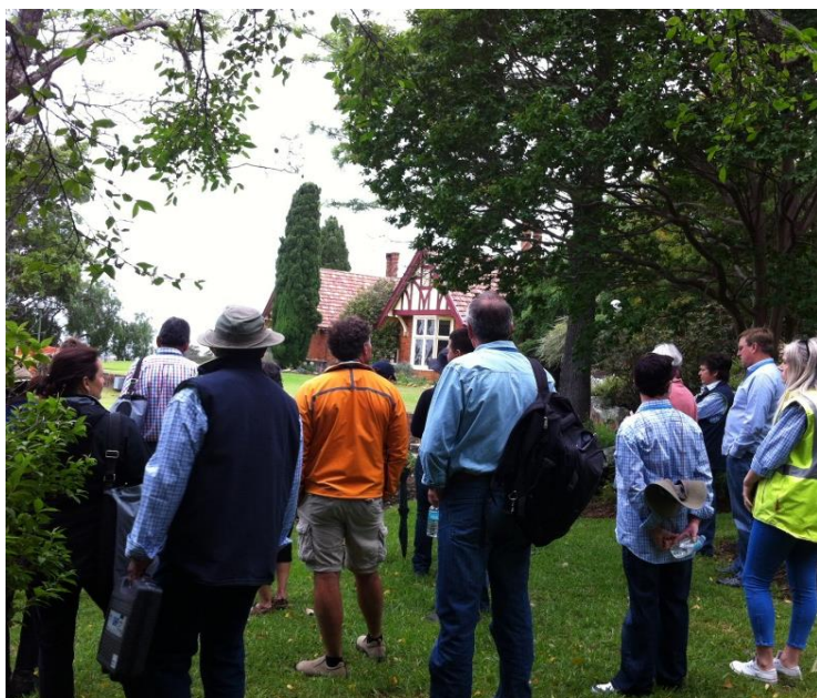
Above: BGANZ members at Wollongong Botanic Gardens during for the bi-annual conference in November 2015.