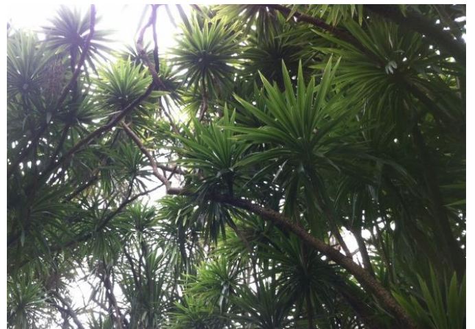
Above: New Zealand Cabbage Trees ( Cordyline australis ) are a feature of our garden.