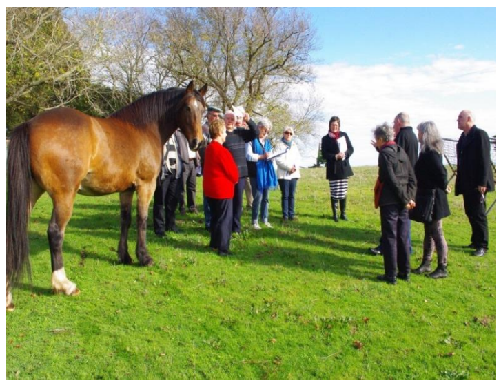
Community members and Corangamite Shire staff (and a large horse) assess the situation at the Arboretum.