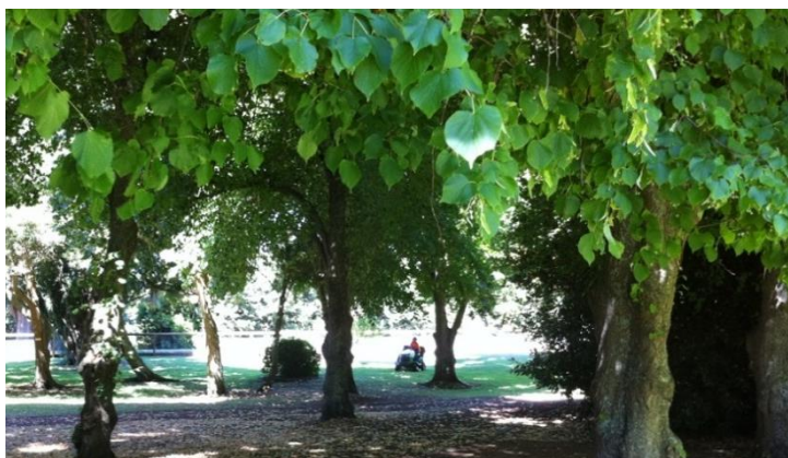
No sign of a pond in February 2013 as Council staff keep the grass under control.