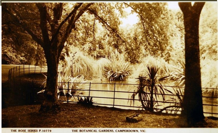
An early postcard of the Gardens showing the ornamental pond.

31 JULY Meeting of CBGA Restoration Group Killara Centre, Camperdown